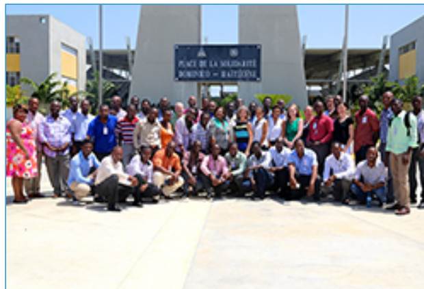
Some of the participants in MIT-Haiti Workshop, June 2016,

In September 2015, six of the most committed Haitian participants spent two weeks at MIT. They enjoyed a rich program of talks and classroom visits, and worked on syllabus enrichment. When they returned to Haiti, five of the six formed a “Konbit” – a Kreyòl term for an agricultural practice common in Haiti as it was in an earlier era in the U.S., in which neighbors cooperate to work their various fields. The Konbit immediately ran a series of workshops in Haiti, amplifying the work of the MIT team. We regard the Konbit initiative as a mark of the coming of age of the MIT-Haiti Initiative.